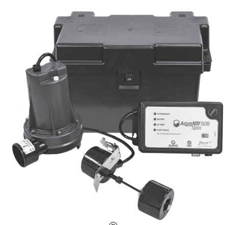
Aquanot® Spin 508 system